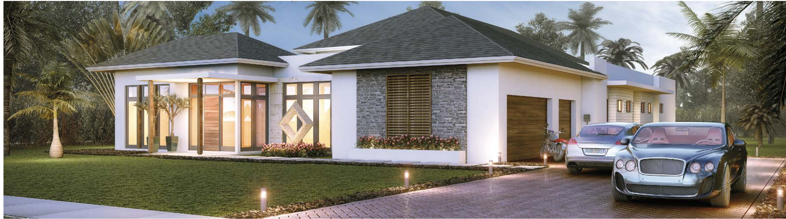
THE SOHO HOUSE 6 BEDROOMS • 6.5 BATHROOMS • MEDIA ROOM • INTERIOR COURTYARD • 3 CAR GARAGE